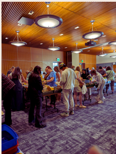
The June Big Book Sale. Our next will be on Sat, October 4th.

☀️ Once again, we had a line starting at 8:30am for our June Big Book Sale , which opened to the public at 10am. Members, and those who joined the Friends that day, were able to enter early at 9am. The word must be out: come early to find the best treasures for all tastes and ages! It seemed like just as many items, if not more, were sold even before the popular 2pm $5 bag sale.